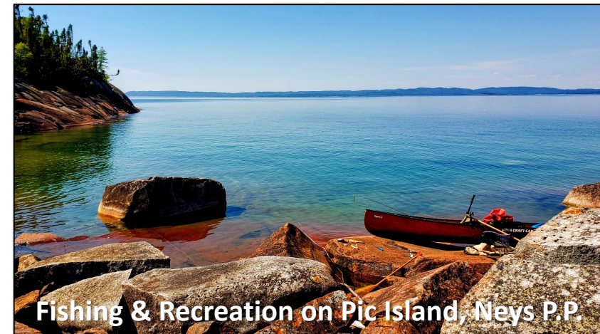
Fishing & Recreation on Pic Island, Neys P.P.