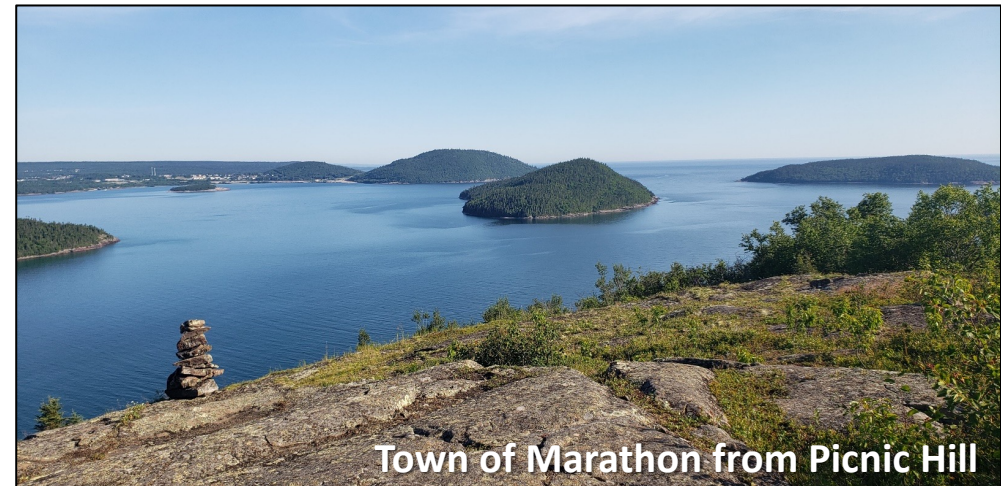
Town of Marathon from Picnic Hill